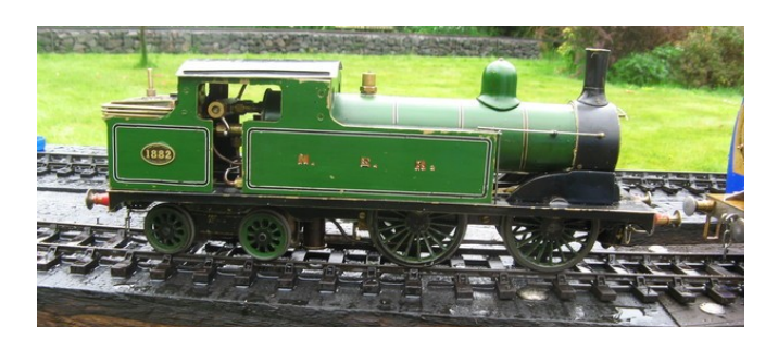
Should you fancy a G5 of your own, there is a 1:1 newbuild project, the details of which you can find at <a href="http://www.g5locomotiveltd.co.uk/">http://www.g5locomotiveltd.co.uk/</a>